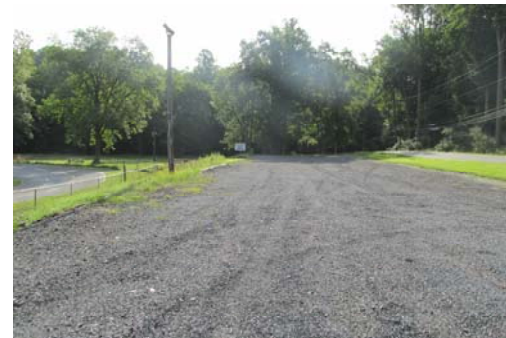
50+ Car Stone Parking Lot