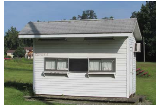
7'x14' Food Stand With Electric & Wall A/C Unit