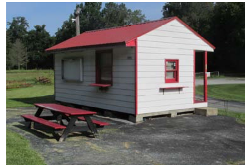
14'x20' Office With Electric

TAXES: YEAR: 2017 $1,216 School: Downingtown 195 County: Chester 0 Municipal: Wallace Twp $1,411 TOTAL